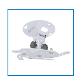
Only 143 mm distance from mounting surface