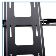
Short screen distance from the wall: only 42 mm