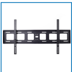
Minimalist design and functionality