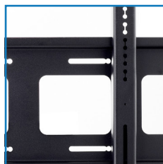
Wide range of VESA mounting holes