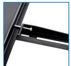
Screen protection against falling